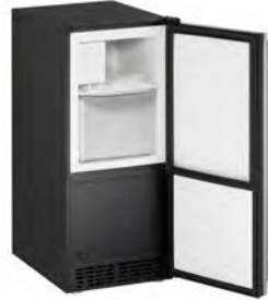
UACR115-BS01A 15" ADA Crescent Ice