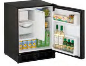
UARI121-BS01A 21" ADA Combo