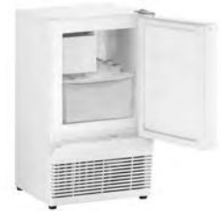
UACR014-WS01A 14" ADA Crescent Ice