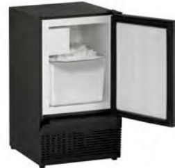
UACR015-BS01A 15" ADA Crescent Ice