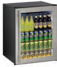
U-ADA24RGLS-13B 24" ADA Refrigerator