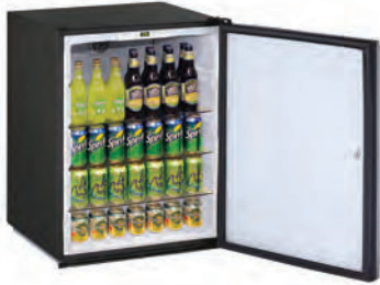
U-ADA24RS-13B 24" ADA Refrigerator