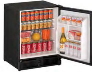
U-29RB-00A 21" ADA Refrigerator