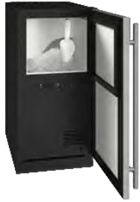
UANB115/UANP115 15" ADA Nugget Ice