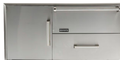
COMBO DRAWERS Model No. CCD-WD