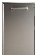
PULL OUT TRASH AND RECYCLE FRONT/BACK DOUBLE BINS Model No. CFBTRC