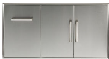
COMBO DRAWERS Model No. CCD-POD