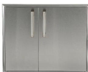
31" DRY PANTRY WITH DRAWERS Model No. CDPC31