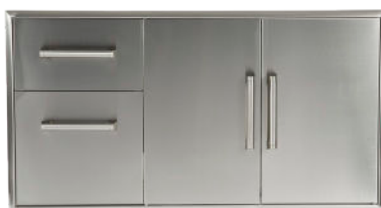
COMBO DRAWERS Model No. CCD-2DC