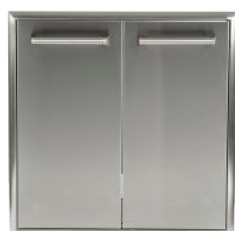
PULL OUT TRASH AND RECYCLE Model No. CTC