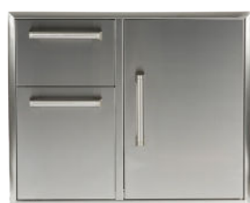
31" SINGLE DOOR AND 2 DRAWERS Model No. CCD-2DC31