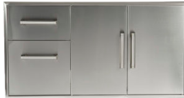
COMBO DRAWERS Model No. CCD-2DC