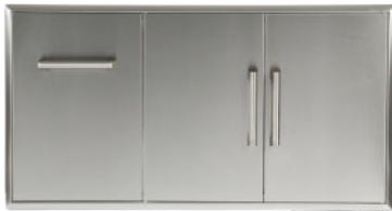
COMBO DRAWERS Model No. CCD-POD