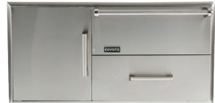
COMBO DRAWERS Model No. CCD-WD