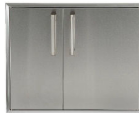
31" DRY PANTRY WITH DRAWERS Model No. CDPC31