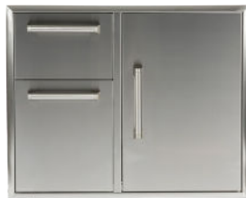
31" SINGLE DOOR AND 2 DRAWERS Model No. CCD-2DC31