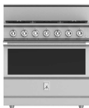
KRG365 36" Range, 5 Burner, Gas, Manual Clean