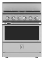
KRD304 30" Range, 4 Burner, Dual Fuel, Self-Clean