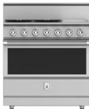
KRG364GD 36" Range, 4 Burner with 12" Griddle, Gas, Manual Clean