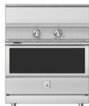
KRI36-BK 36" Range, 5 Elements, Induction, Self-Clean