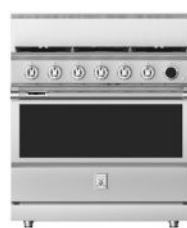
KRD365 36" Range, 5 Burner with Smart Burner, Dual Fuel, Self-Clean