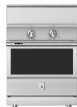
KRI30-BK 30" Range, 4 Elements, Induction, Self-Clean