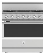
KRD365 36" Range, 5 Burner, Dual Fuel, Self-Clean