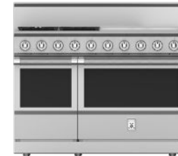
KRG484GD 48" Range, 4 Burner with 24" Griddle, Gas, Manual Clean