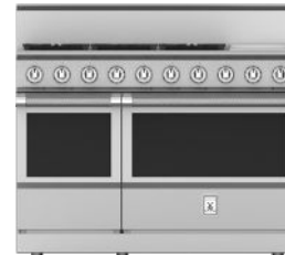
KRG485GD 48" Range, 5 Burner with 12" Griddle, Gas, Manual Clean