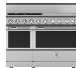
KRD484GD 48" Range, 4 Burner with 24" Griddle, Dual Fuel, Self-Clean