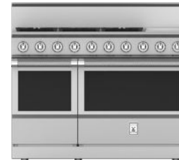
KRG485GD 48" Range, 5 Burner with 12" Griddle, Gas, Manual Clean $14,119