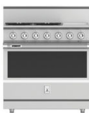
KRD364GD 36" Range, 4 Burner with 12" Griddle, Dual Fuel, Self-Clean $13,089