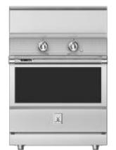
KRI30-BK 30" Range, 4 Elements, Induction, Self-Clean $8,989