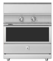
KRI36-BK 36" Range, 5 Elements, Induction, Self-Clean $12,839