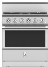
KRG304 30" Range, 4 Burner, Gas, Manual Clean $6,419