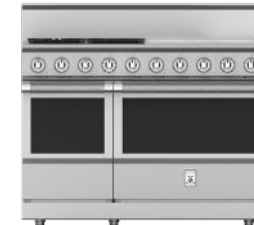
KRG484GD 48" Range, 4 Burner with 24" Griddle, Gas, Manual Clean $14,759