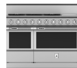
KRD485GD 48" Range, 5 Burner with 12" Griddle, Dual Fuel, Self-Clean $17,969