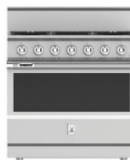
KRD365 36" Range, 5 Burner, Dual Fuel, Self-Clean $12,199