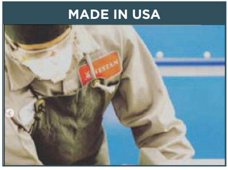
All grills are proudly designed, engineered and manufactured in Anaheim, California.