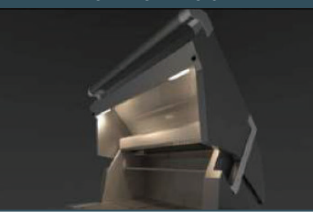
Spring assisted hinge system allows hood to easily open and will hold at any desired height. Motion-activated Halogen Stadium Lights<sup>™</sup>.