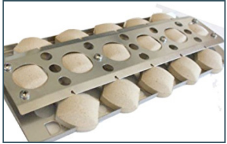
Patented flip-to-clean radiant tray with monogrammed ceramic briquettes generates smoky flavor from drippings.