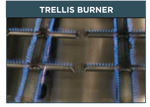
The patented Trellis Burner<sup>™</sup> delivers 25,000 BTU's of power with greater heat coverage and precision control.