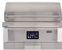
36" Built-In Pellet Grill C1P36