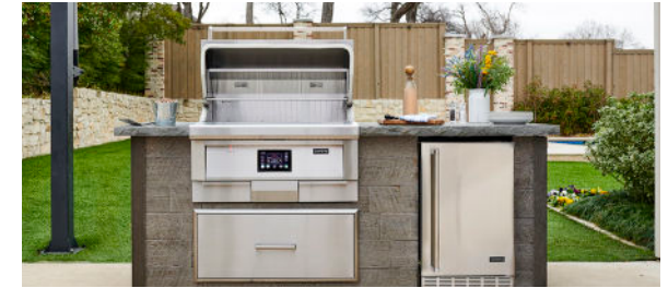
RTA Built-In Offering Available in 6' and 8'