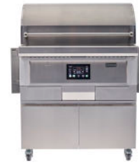
36" Freestanding Pellet Grill C1P36-FS