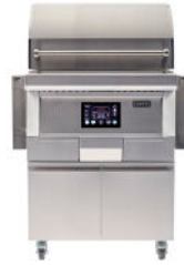
28" Freestanding Pellet Grill C1P28-FS