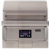
28" Built-In Pellet Grill C1P28