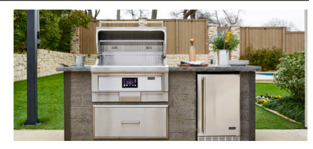
RTA Built-In Offering Available in 6' and 8'