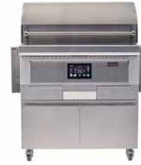
36" Freestanding Pellet Grill C1P36-FS $4,399