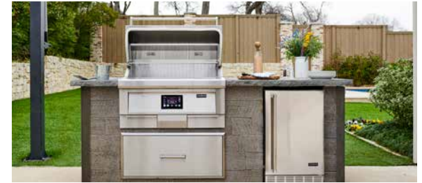
RTA Built-In Offering Available in 6' and 8'