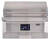
36" Built-In Pellet Grill C1P36 $3,499