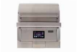
28" Built-In Pellet Grill C1P28 $2,999