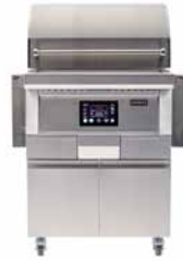
28" Freestanding Pellet Grill C1P28-FS $3,499