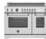
MAS486IGFEPXT 6 induction zones + cast iron griddle $12,999