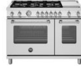
MAS486GGASXV 6 burners + electric griddle $8,799