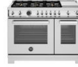
PRO486BTFGMXT 6 burners + electric griddle $10,999