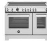
PRO486IGFEPXT** 6 induction zones + cast iron griddle $12,999