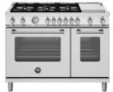
MAS486GDFMXV 6 burners + electric griddle $8,799