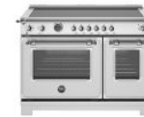
HER486IGFEPXT*** 6 induction zones + cast iron griddle $16,999