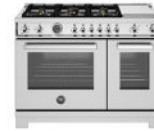
PRO486BTFEFXT 6 burners + electric griddle $11,999