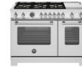
MAS486BTFEPXT 6 burners + electric griddle $11,999