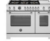
MAS486BTFGMXT 6 burners + electric griddle $10,999