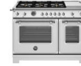
HER486BTFGMXT 6 burners + electric griddle $14,999