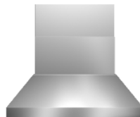
KPH48XT $2,799 KPH482XT $3,199